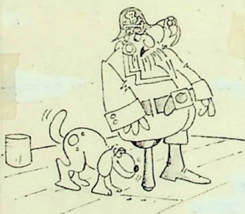
"I'd think again about that!"

Please list in full any complaints you might want to register against the management, write legibly in the box below.