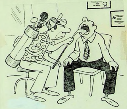
"I hope I'm not keeping you from anything, doctor."