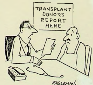
"We've checked your body parts and none of them are worth transplanting."