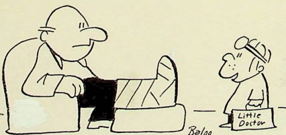
"As you know, medical costs have skyrocketed — that'll be fifty cents."

AT MY AGE I OFTEN WONDER WHY PEOPLE DON'T USE THIS SIZE TYPE