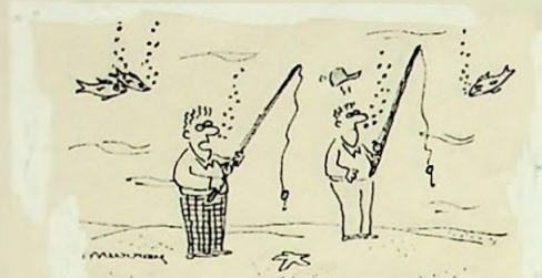
"I don't know, are you sure this is how to deep sea fish?"