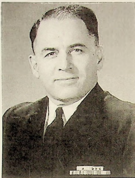
WASHINGTON, DC - 1958