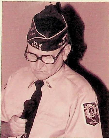
St. Louis, MO Reunion - 1989

Ed. Note: I would disagree with his statement.