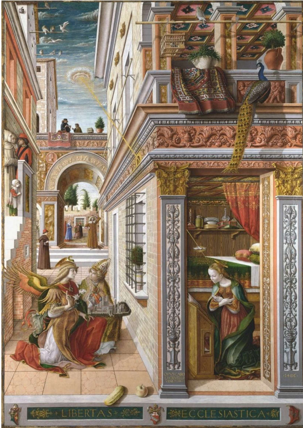
Carlo Crivelli The Annunciation with Saint Emidius (1486)

he is being baptized with the Holy Spirit by John the Baptist.